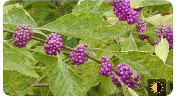
AMERICAN BEAUTYBERRY Callicarpa americana