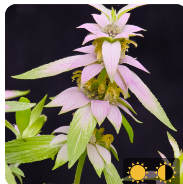
BEE BALM Monarda spp.