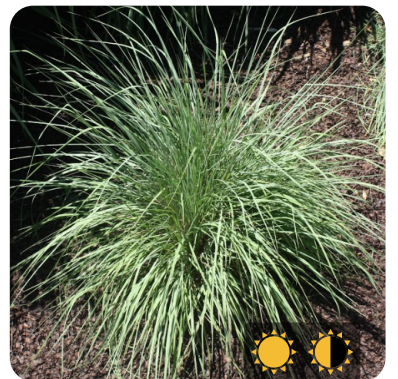
LITTLE BLUESTEM Schizachyrium scoparium