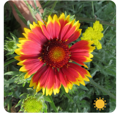
INDIAN BLANKET Gaillardia pulchella