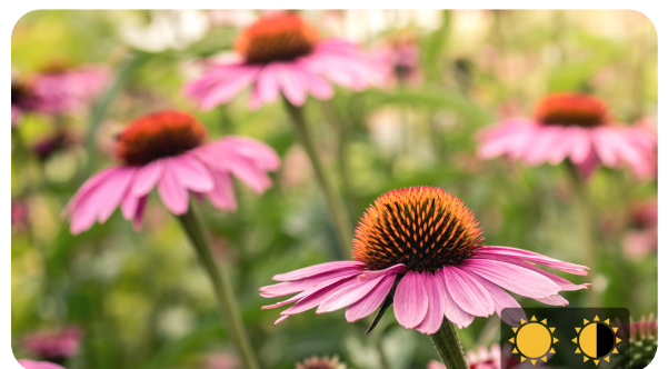
PURPLE CONEFLOWER Echinacea purpurea