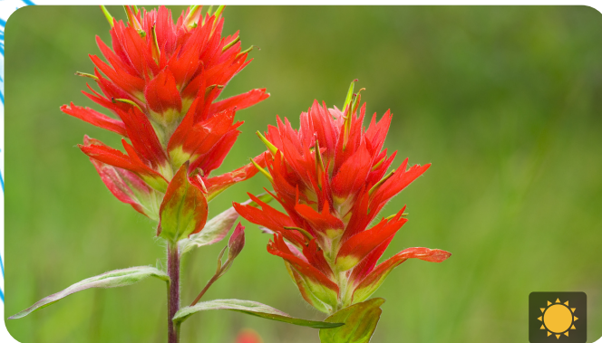
INDIAN PAINTBRUSH Castilleja indivisa