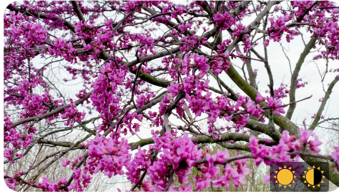
EASTERN REDBUD Cercis canadensis

*Environmental Protection Agency, Water Efficiency Management Guide