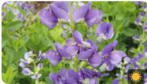
BLUE FALSE INDIGO Baptisia australis