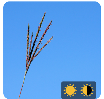
BIG BLUESTEM Andropogon gerardii