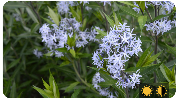
ARKANSAS BLUESTAR Amsonia hubrichtii