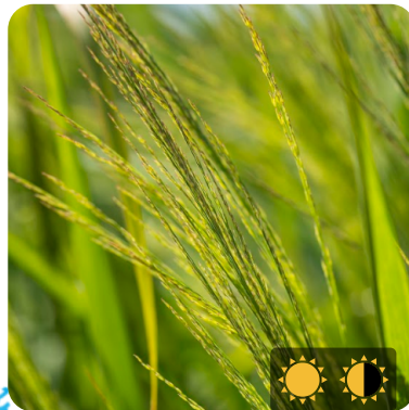
SWITCHGRASS Panicum virgatum