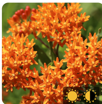
BUTTERFLY MILKWEED Asclepias tuberosa