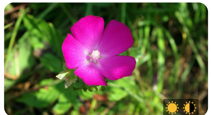
PURPLE POPPY MALLOW Callirhoe involucrata