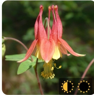
EASTERN RED COLUMBINE Aquilegia canadensis

Rain gardens provide many benefits such as flood reduction and stormwater pollutant capture, but one of the most noticeable of benefits of a rain garden is its aesthetic quality. Selecting beautiful and hardy plants for your rain garden can save water and boost your home's curb appeal. Let's look at some Oklahoma native plants well-suited for your rain garden.